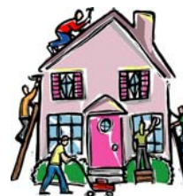
Nashville Mission Trip