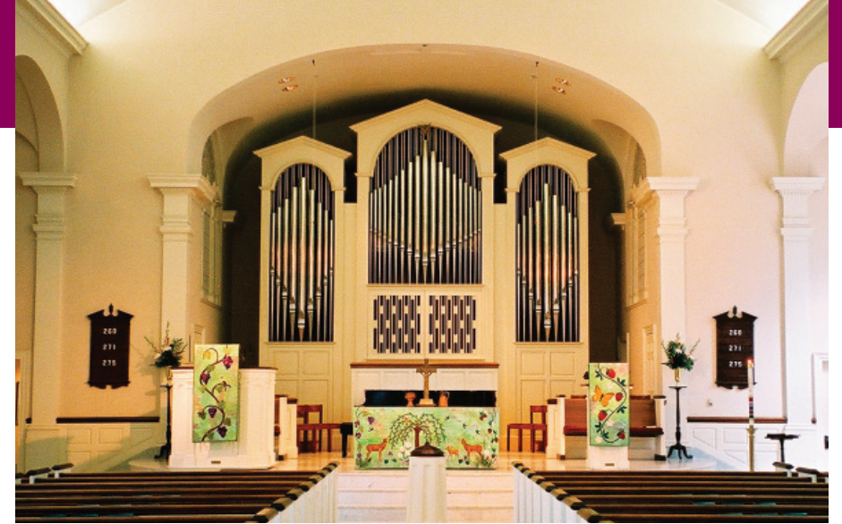
Gabriel Kney Organ fully clothed

Thursday, April 28 at 12:30 p.m. Together these two accomplished musicians create a beautiful soundscape that is both bold and understated,